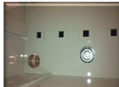
Airflow Chambers of the IDC

Staber Industries contact for more information: sales@staber.com or